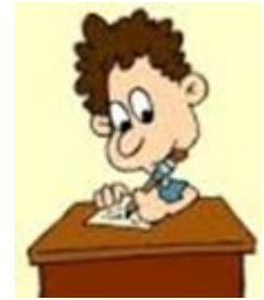
Just Do Your Best