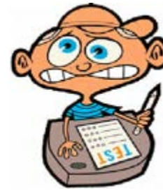
Don't Stress on the Test